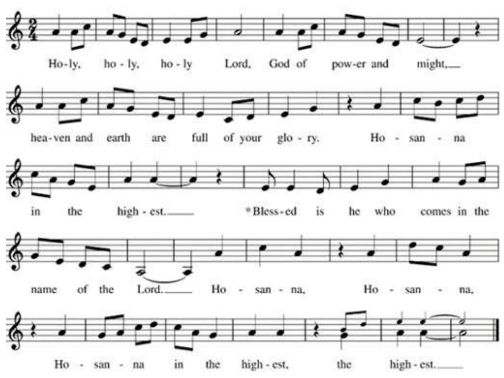
The people stand or kneel. The Celebrant continues

Blessed are you, gracious God, creator of the universe and giver of life. You formed us in your own image and called us to dwell in your infinite love.